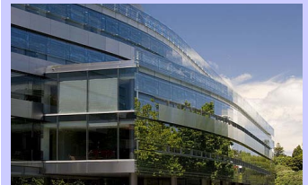
Owen Glenn Building, Grafton Road, Auckland, New Zealand