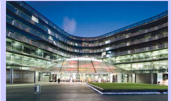
John Hood Plaza, Owen Glenn Building